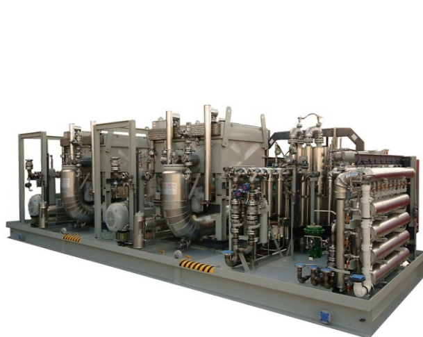
Tahiti—Gulf of Mexico