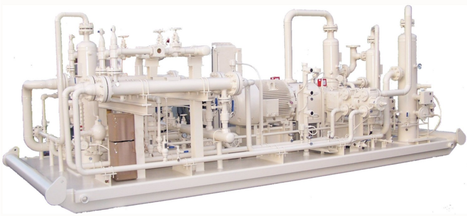
Hydrocarbon Gas Compressor

Our thirty plus years of experience in gas handling equipment makes us one of the leaders in the design of primary and post compression packages. Systems have including designs with flow rates from 15 scfm (25 Nm 3 /hr) to 400 scfm (630 Nm 3 /hr) and final output pressures of up to 9,000 psig (620 barg). Systems are designed to meet the harshest environments and both U.S. and European Hazardous area classifications.